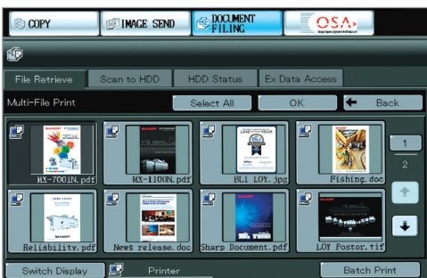
Sharp's easy-to-use Document Filing System with thumbnail preview*

The Sharp MX-M266N/M316N/M356N monochrome document systems deliver professional performance and optimal productivity to satisfy your daily production needs. Copy and print speeds of up to 26, 31, and 35 pages per minute help you meet project deadlines with time to spare. The flexible paper handling system can feed up to 28 lb. bond stock through the paper trays and up to 110 lb. index bond through the bypass tray. With available on-line paper capacity of up to 2,100 sheets, the MX-M266N/M316N/M356N document systems are ready when you are.