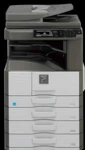
The MX-M316N shown with job separator.

1200 x 600 dpi resolution with standard PCL compatibility; optional PostScript 3 driver delivers robust performance.