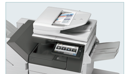
Sharp's ImageSEND™ feature provides one-touch distribution to email, cloud applications and more.