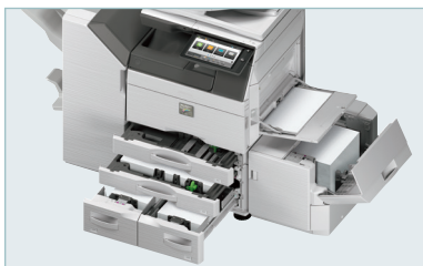
Provides up to six paper sources for a maximum paper capacity of 6,300 sheets.