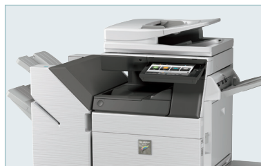
Select staple finishers also offer manual stapling and stapleless stapling.