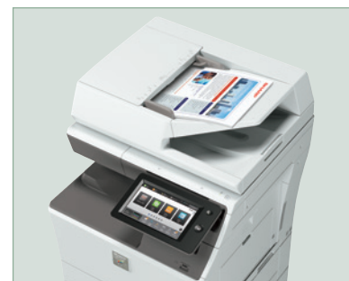
Sharp's ImageSEND™ feature provides one-touch distribution to email cloud applications and more.