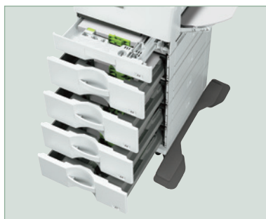
Offers up to six paper sources for a maximum 2,700-sheet capacity (shown with optional trays).